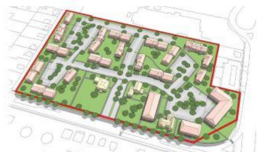
Concept Scenario C