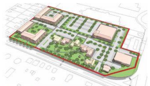
Concept Scenario B