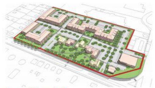
Concept Scenario A

The final report, 111 pages long, includes sample site plan options, shown at right, can serve as a guide for future development. In addition, an in depth analysis of current demographic and market conditions provides recommendations for the types of businesses most likely to thrive in the community. An analysis of the historic structures on the site was also completed, leading to recommendations for how they could be repurposed in a positive way to promote economic development and contribute to the fabric of the community. A link to the Vibrant Communities Initiative – Elmcrest Site – Final Report is available on the Home Page of Town of Portland website at portlandct.org .